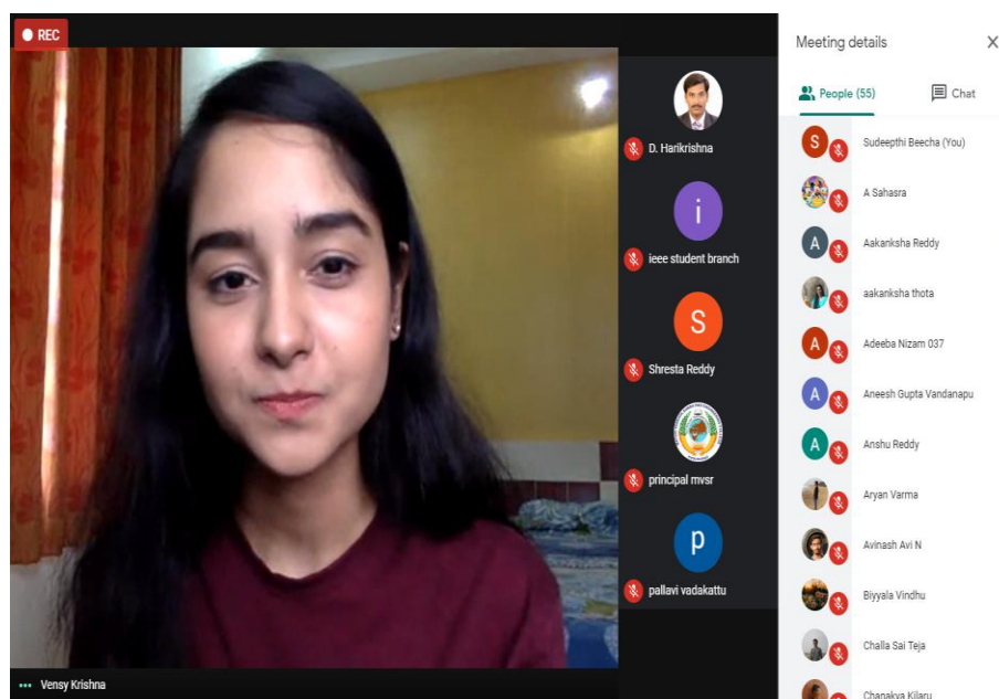
Speaker addressing the session

She has addressed to the attendees that they should be self-motivated all the time and also take the advice and guidance from their seniors.